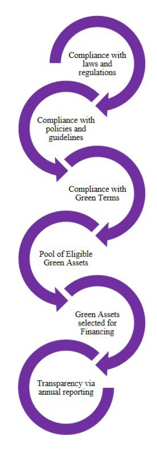
The Selection Process of Eligible Green Assets at Fabege

The GBC will review information about the assets and evaluate the overall environmental impact, which includes life cycle considerations, potential rebound effects, resilience considerations and adherence to at least one of the Environmental Objectives. The projects and assets must also be compliant with applicable national laws and regulations, as well as policies and guidelines at Fabege. The Business Council can request additional information and consult with internal parties, but the mandate to make decisions is held by the group. A decision to allocate net proceeds will require a consensus decision by the GBC, whereby the Head of Sustainability effectively holds a veto. Decisions by the GBC will be documented. An updated list of all Green Assets will be kept by Fabege's Treasury Department. If a project or asset ceases to meet the Green Terms, it will be removed from the list (and the funds will be recycled). The list will also be used as a tool to determine if there is a current or expected capacity for additional Green Financing.